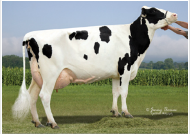
Carmony Plato 3295-Grade