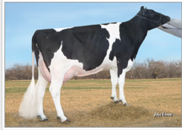
Farriss Dairy Plato 1356-Grade