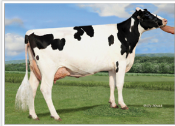
Art-Acres Plato Sue 1282